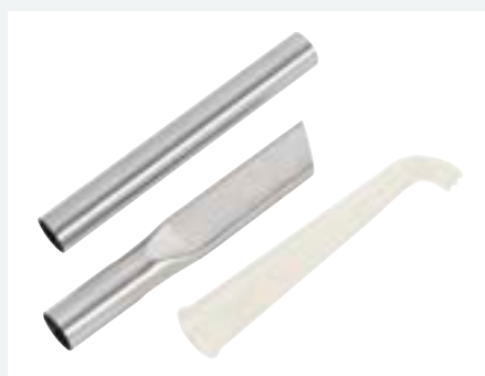
Autoclavable stainless steel and silicone end-tools