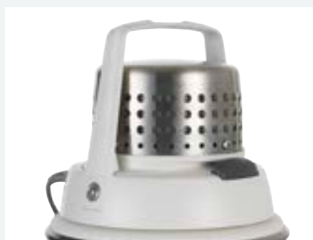
Standard AISI 316 stainless steel