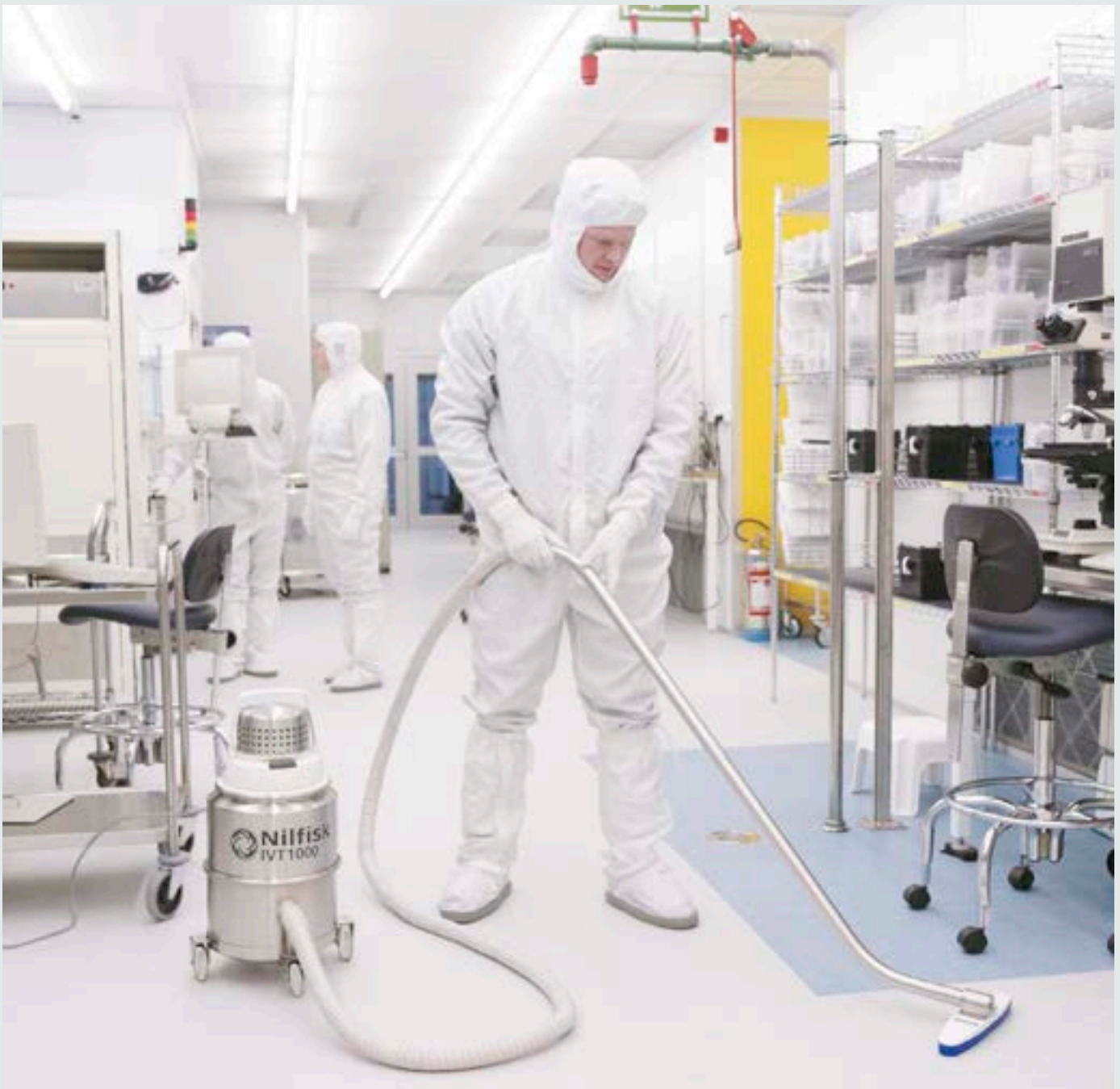
Maximum sterilization and full contamination control