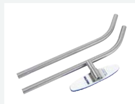
Autoclavable stainless steel handgrip and silicone