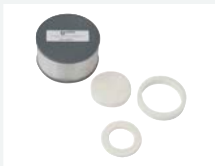
Standard downstream ULPA 15 filter